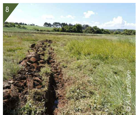
5. 6. 7. 8. Digging a ditch.