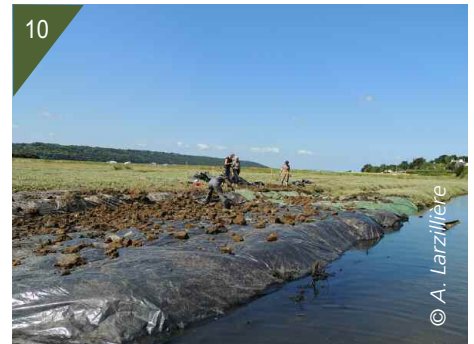
9. 10. Laying tarps.