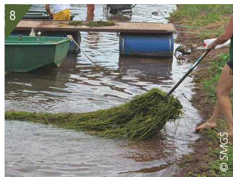
4. Harvester boat.