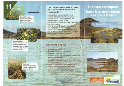
11. Informational brochure distributed by the Hérault department.

Authors: Corinne Roumagnac, Hérault departmental council, Doriane Blottière, IUCN French committee, Victoria Dubus, SMGS. January 2018.