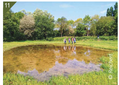
10. Reed bed in pond Acigné 02 (after the work).