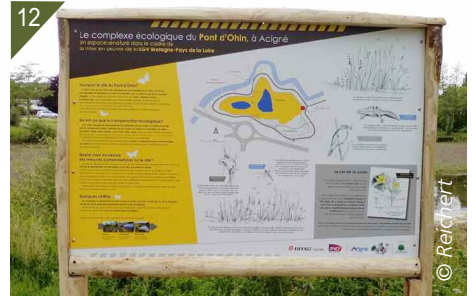
12. Informational sign on the Acigné 02 site.