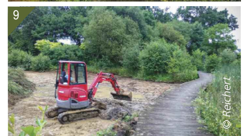
4, 5. Acigné 02 pond, prior to the work. 6. Mechanical uprooting in Acigné 02. 7. Filtering system during pumping of Acigné 02. 8, 9. Removing the surface soil in Acigné 02.