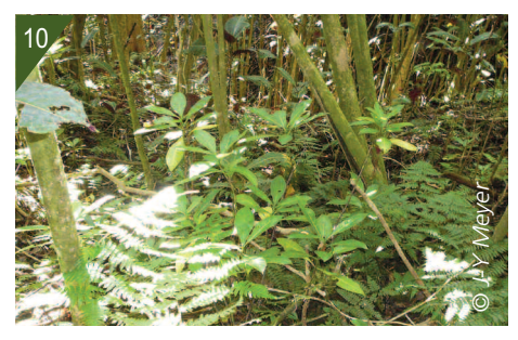
10. Regrowth of endemic species following defoliation of Miconia trees.