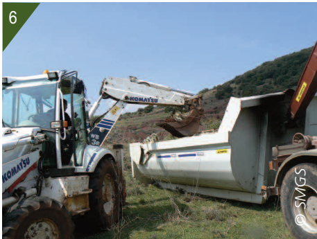
3. A Hudson pear developing from a segment. 4, 5, 6. Mechanical uprooting.