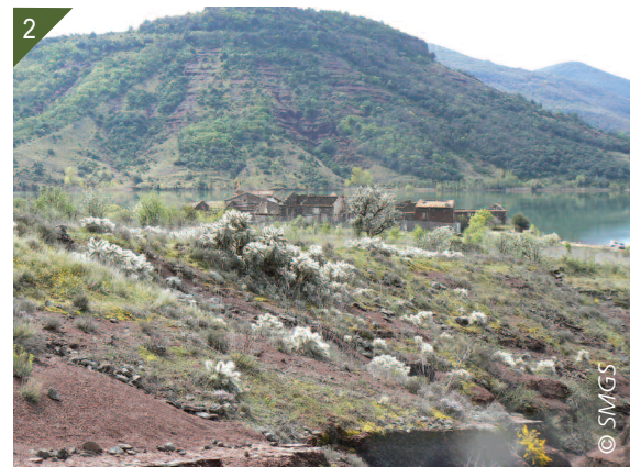
1. Hudson pear sites in Celles. 2. A site in 2009, prior to the intervention.

of injury to livestock and wildlife, as well as a danger for people working in colonised areas.