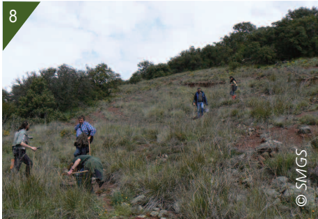
7, 8. Manual uprooting.