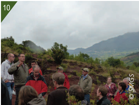
9. The site in 2016 after the work. 10. Visit to the site during the EWRS symposium in May 2014.