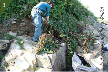
1. The Hottentot fig (on the right) is a threat to the swards of salt-tolerant grass comprising least adder's-tongue and land quillwort, two very rare species. 2. Uprooting Hottentot-fig plants on Ouessant. 3. Uprooting Hottentot-fig plants on Molène.