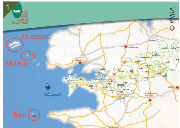
Position of the three islands off the coast of Brittany.