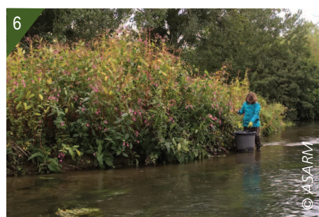
3, 4. Balsam plants on the banks of the Risle River.