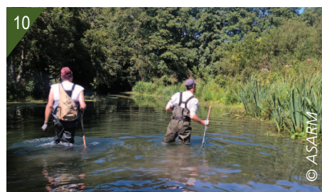
7, 8, 9. Manual uprooting of Himalayan balsam. 10. Inspections along the Risle River.