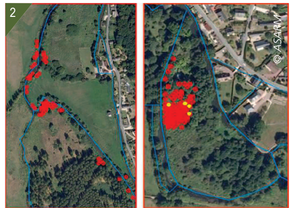
Change in colonised sites from September 2015 to October 2018.