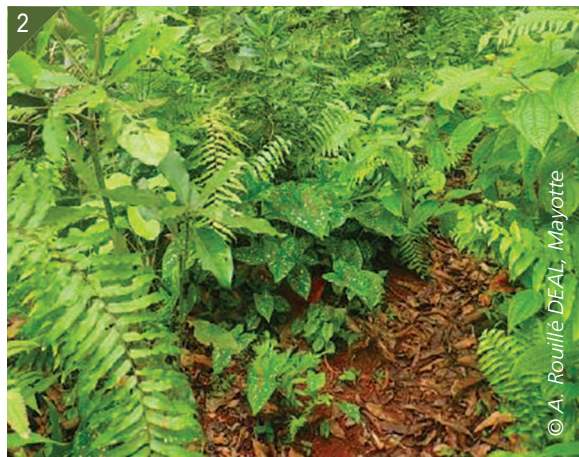
1, 2. Caladium bicolor plants in the Mount Hachiroungou departmental forest.