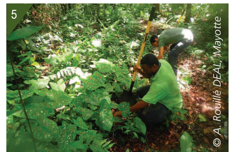
3, 4, 5. Uprooting bulbs and rhizomes.