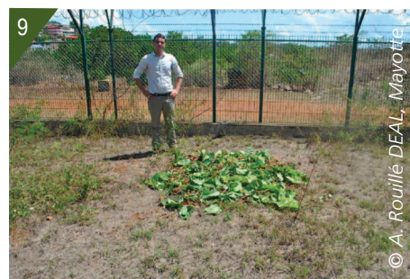
6. An uprooted Caladium plant. 7. An unearthed Caladium bulb. 8. Bagged Caladium waste. 9. Drying the green waste