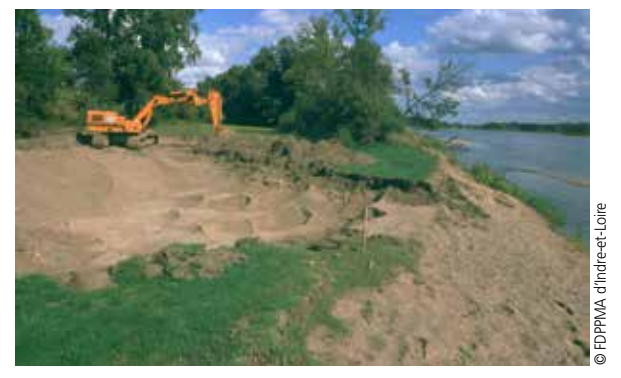
Reconnection of Le Gros Ormeau side channel with the Loire. September 1999.

Perched above average levels, marshes and side channels do not remain flooded long enough to allow fish reproduction. Spawning grounds, even if they maintain valuable flooding conditions, are frequently isolated due to building up of gravel shoal downstream of the side channels and also due to the incision of the main river bed.