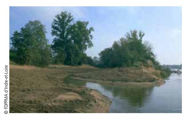
Le Gros Ormeau side channel after reconnection with the Loire. October 1999.

More comprehensively, multidisciplinary monitoring was carried out on five restored river side channels on the middle Loire.