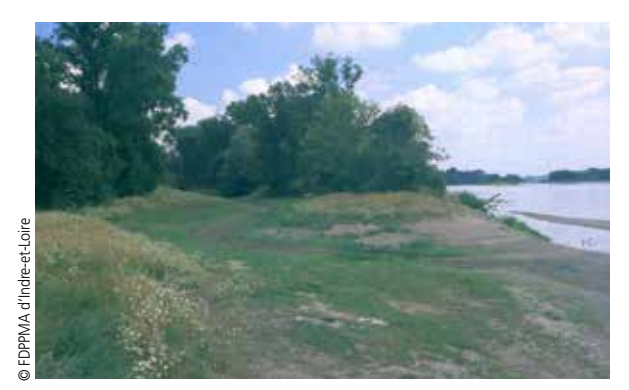
Reconnection of Le Gros Ormeau side channel with the Loire. August 2000.

The physical and chemical features of water were analysed five times a year; the hydraulic operation of each site (floodability / connectivity), and biological factors (invertebrates, zooplankton, fish and vegetation) were monitored and analysed for each area during the 2002 campaign. The monitoring of side channels by the CSP (now Onema), was completed in 2007. Since then, the monitoring measures are taken care by different project owners involved in restoration projects.