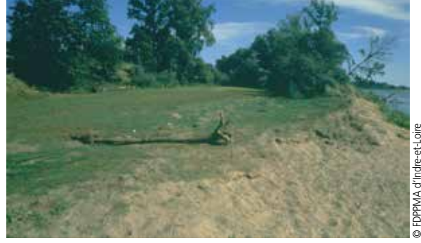
Le Gros Ormeau side channel before reconnection work. August 1999.