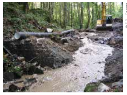
The Maria stream in October 2004 during the removal of a weir – Nièvre