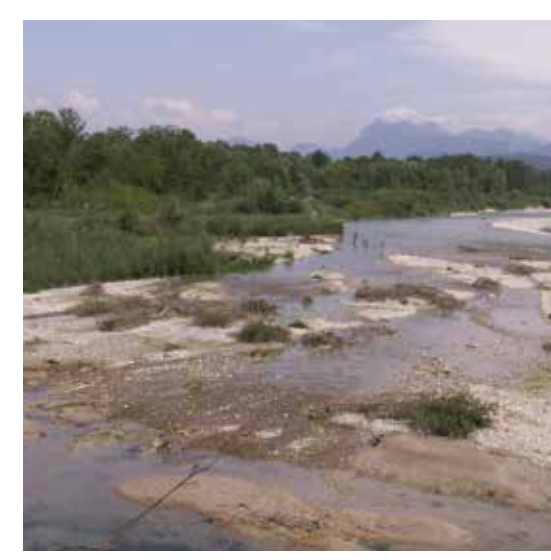
> The Drôme, a lowland river with a braided channel