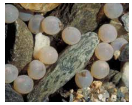
> Example of a main channel habitat required for the reproduction of certain species