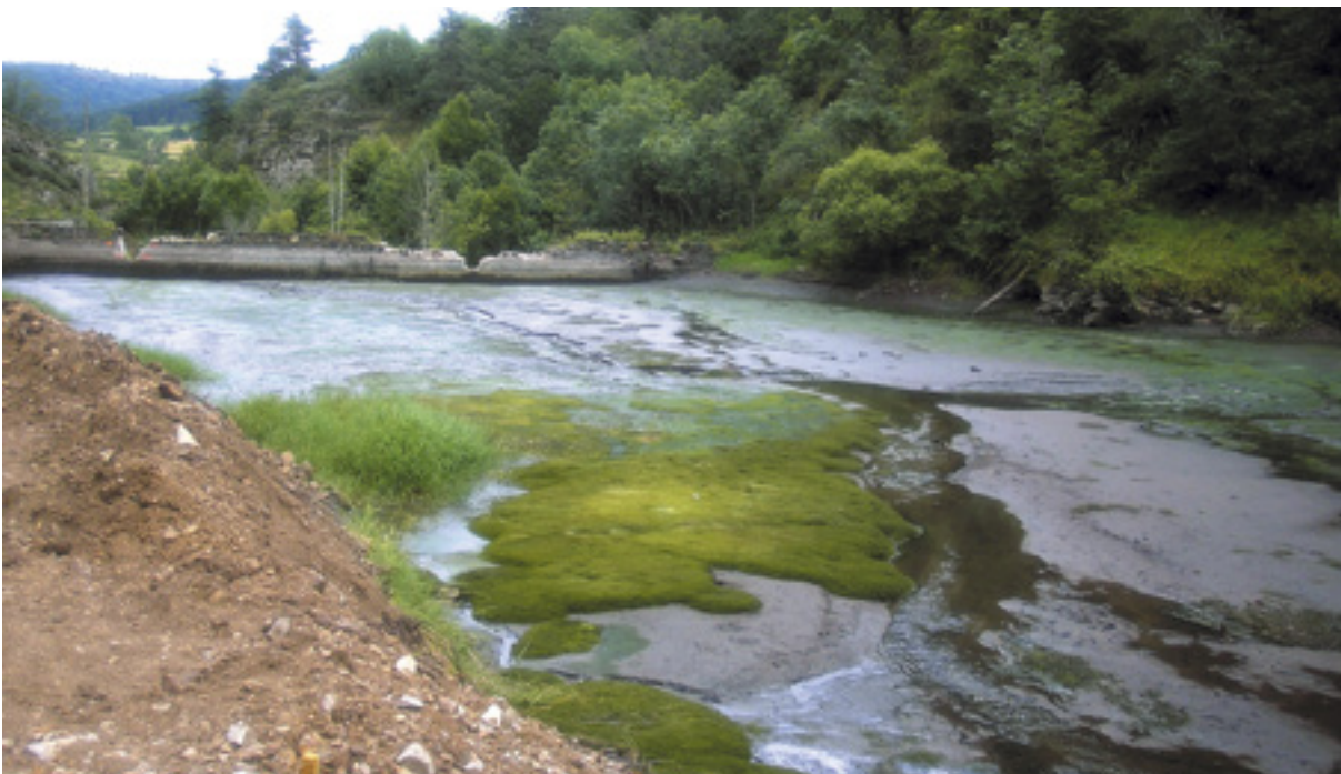
Stéphane Nicolas - FDPPIVA 43