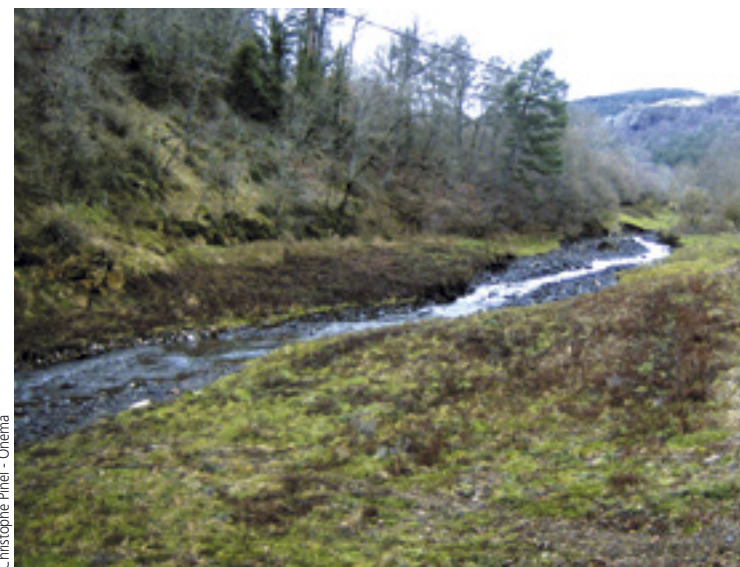
Christophe Pinel - Onema

year after the work, the species diversity of the original fish community (trout, bullhead, stone loach) had been restored. The effective return of the fish populations was thus very rapid.