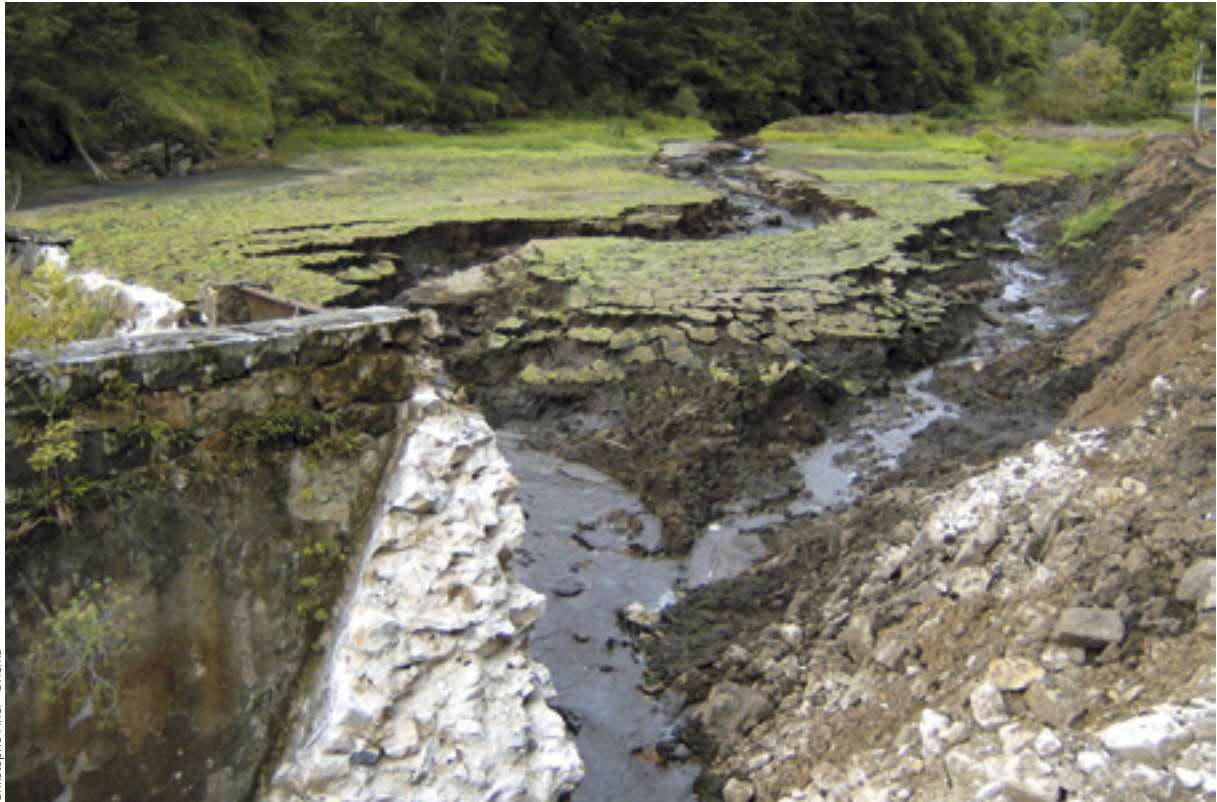
Christophe Pinel - Onema