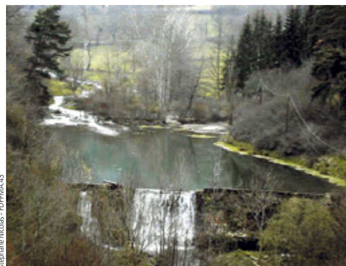
Stéphane Nicolas - FDPPMA-43