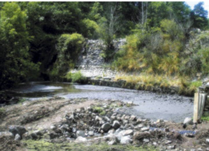
Stéphane Nicolas - FDPPIVA 43