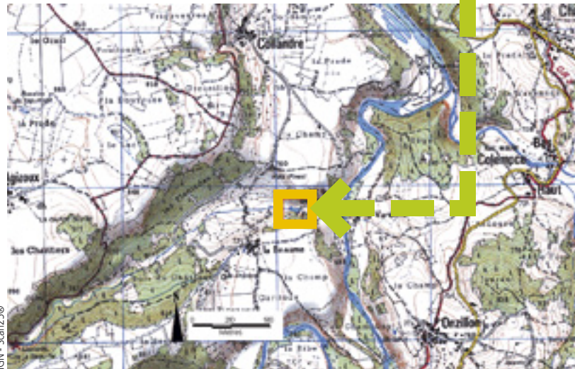
IGN - Scan250